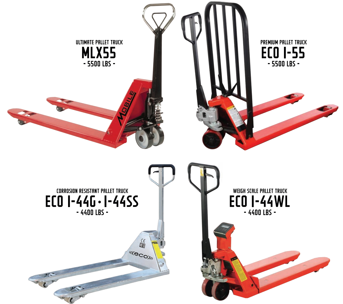
ULTIMATE PALLET TRUCK MLX55 - 5500 LBS -

TANDEM • LOAD BACKREST • QUICK LIFT PUMP • AUTO BRAKE • DRIVE-ASSIST • 4-WAY FORK DIMENSIONS • LOW/SUPER LOW PROFILE FORKS • WEIGH SCALE • ROLL HANDLING FORKS • CORROSION RESISTANT • HEAVY DUTY • ROUGH TERRAIN