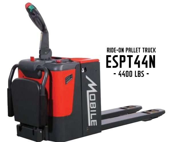
RIDE-ON PALLET TRUCK ESPT44N - 4400 LBS -