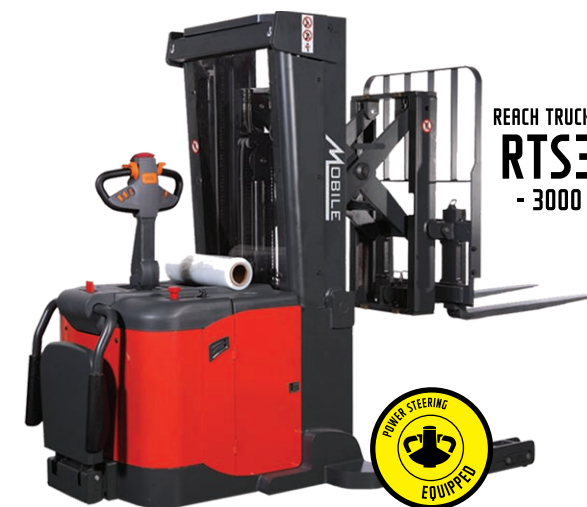
REACH TRUCK STACKER RTS30N - 3000 LBS -