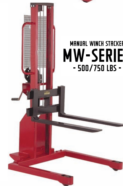
MANUAL WINCH STACKER MW-SERIES - 500/750 LBS -