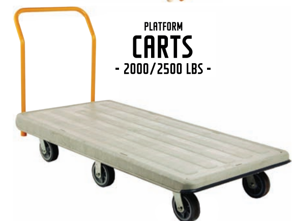
PLATFORM CARTS - 2000/2500 LBS -