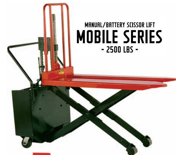
MANUAL/BATTERY SCISSOR LIFT MOBILE SERIES - 2500 LBS -

(SCISSOR LIFTS) MANUAL PUMP • BATTERY OPERATED • CORROSION RESISTANT • STAINLESS STEEL • FOOT PUMP (ALLIED EQUIPMENT) SAFETY GATES • QUARTER PALLET DOLLIES • SIDING CARTS • STORAGE RACKS • ELECTRIC SHOPPING CARTS • ELECTRIC LIFT HAND TRUCKS