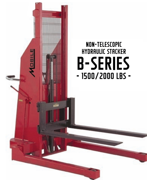
NON-TELESCOPIC HYDRAULIC STACKER B-SERIES - 1500/2000 LBS -

FIXED STRADDLE • FORK OVER • APPLICATION SPECIFIC • ON-BOARD TOTE STACKER • AC POWER • 5TH WHEEL • FIXED PULL HANDLE • HAND REMOTE CONTROL • SNAP-ON PLATFORM • MODIFIED FORK LENGTHS