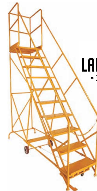
ROLLING LADDERS - 350 LBS -