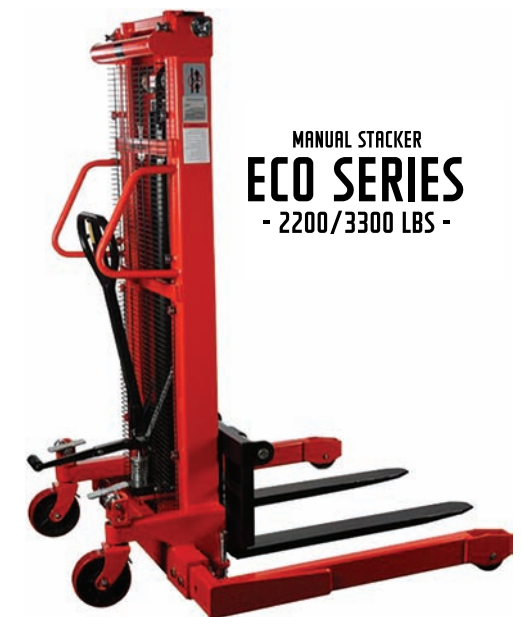
MANUAL STACKER ECO SERIES - 2200/3300 LBS -