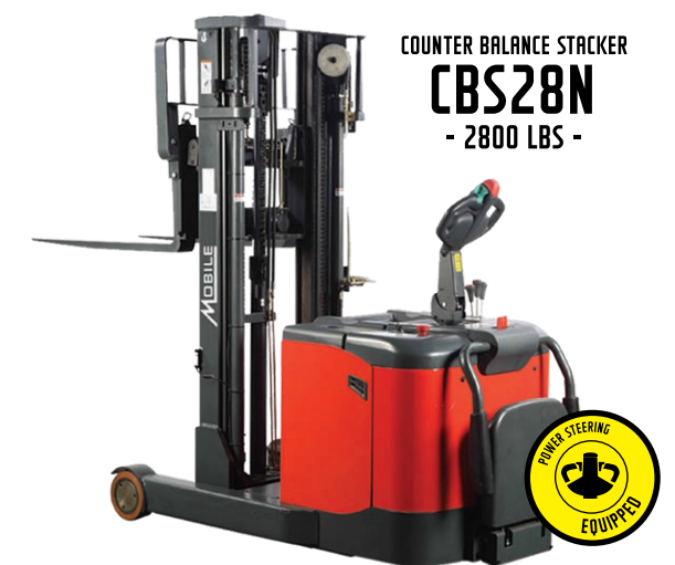
COUNTER BALANCE STACKER CBS28N - 2800 LBS -