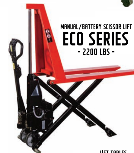
MANUAL/BATTERY SCISSOR LIFT ECO SERIES - 2200 LBS -