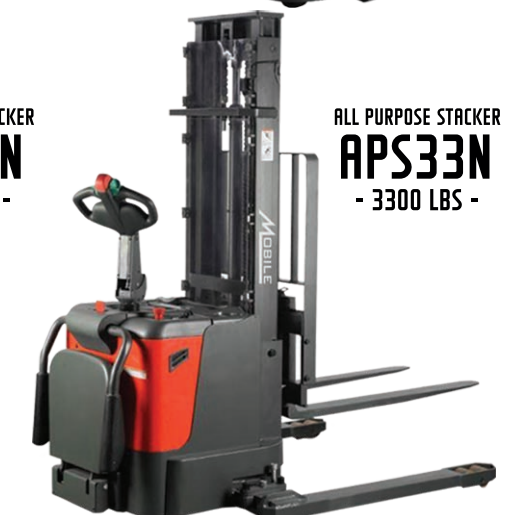
ALL PURPOSE STACKER APS33N - 3300 LBS -

ESET33N: Capacity (lbs): 3300, Fork Widths (inch): 20.5 / 27, Fork Lengths (inch): 48, Options: Full Electric Lift/Drive Capability (EFET33N model) ESPT44N: Capacity (lbs): 4400, Fork Widths (inch): 21.3 / 27, Fork Lengths (inch): 45 / 48, Options: Ride-On Operator Platform (ESPT44RN model) HESPT60N: Capacity (lbs): 6000, Fork Widths (inch): 22 / 27, Fork Lengths (inch): 48 CBS28N: Capacity (lbs): 2800, Lift Heights (inch): 116 / 144 / 175, Reach Distance (inch): 21.7 (116" Lift), 22.8 (144" / 175" Lift) RTS30N: Capacity (lbs): 3000, Lift Heights (inch): 112 / 139 / 179 / 214, Reach Distance (inch): 22.4 APS33N: Capacity (lbs): 3300, Lift Heights (inch): 124 / 156 / 179 / 215 / 234, Straddle Leg I.D. / O.D. (inch): 38-50 / 47.8-59.8 APS33NFF (Fork-Over): Capacity (lbs): 3300, Lift Heights (inch): 141 / 157 / 181 / 216 / 236 LLS22 Low Lift Stacker (model not shown): Capacity (lbs): 2200, Lift Height (inch): 76