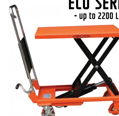
LIFT TABLES ECO SERIES - up to 2200 LBS -