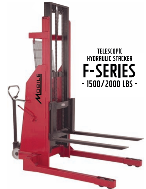
TELESCOPIC HYDRAULIC STACKER F-SERIES - 1500/2000 LBS -