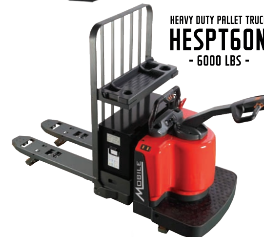
HEAVY DUTY PALLET TRUCK HESPT60N - 6000 LBS -