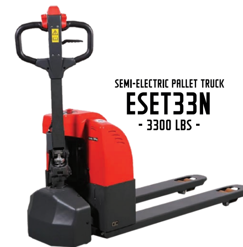
SEMI-ELECTRIC PALLET TRUCK ESET33N - 3300 LBS -

SEMI-ELECTRIC / RIDE-ON / HEAVY DUTY PALLET TRUCKS • ALL PURPOSE / HIGH REACH / RIDE-ON / COUNTERBALANCE / REACH / LOW LIFT STACKERS • TUG MOTORS • PLATFORM CARTS • SHOPPING CARTS