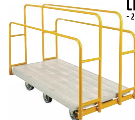
LUMBER CARTS - 2000 LBS -

MOBILE SCISSOR LIFTS (MPS25 MANUAL / BPS25 BATTERY): Capacity (lbs): 2500, Fork Widths (inch): 20.5 / 27, Fork Lengths (inch): 48 Options: Hand Remote (BPS25) ECO SCISSOR LIFTS (EMSL22N MANUAL / EBSL22N BATTERY): Capacity (lbs): 2200, Fork Widths (inch): 21 / 27, Fork Lengths (inch): 46 Options: Corrosion Resistant, Stainless Steel Body (EMSL22N-SS / EMSL33N-SS) ECO LIFT TABLES: Capacity (lbs): 330 / 660 / 770 / 1100 / 1650 / 2200, Platform Dimensions/Lift Heights: Various Options: Extra Large Platform Dimensions, Battery Operated Lift (770lb Capacity Model) ROLLING LADDERS: Capacity (lbs): 350, Lift Heights (inch): 29-140, Step Count: 3 / 4 / 6 / 8 / 10 / 14 Options: Tilt n' Roll, 50°/60° Incline PLATFORM TRUCKS: Capacity (lbs): 2000 / 2500, Platform Width (inch): 24 / 30, Platform Length (inch): 48 / 60 Options: Steel Bed, Plastic Bed, Aluminum Bed LUMBER CARTS: Capacity (lbs): 2000, Platform Width/Length: Various